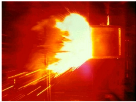
Figure 1: Arc flash events release large amounts of energy.

Arcing faults release large amounts of energy in the form of radiant heat, intense light, and high pressure waves. The temperature in an arcing fault reaches as high as 20,00° C. The rapid increase of temperature expands the volume of the air causing a pressure wave which in turn leads further to a potentially damaging sound wave as well. The extreme temperatures cause switchgear components to vaporize within milliseconds. High pressure leads to opening of switchgear doors, releasing extreme energy to exposed personnel, should they be in the area during the arcing fault. In addition to direct light, temperature and pressure effect other danger factors include release of toxic gases and burning shrapnel.