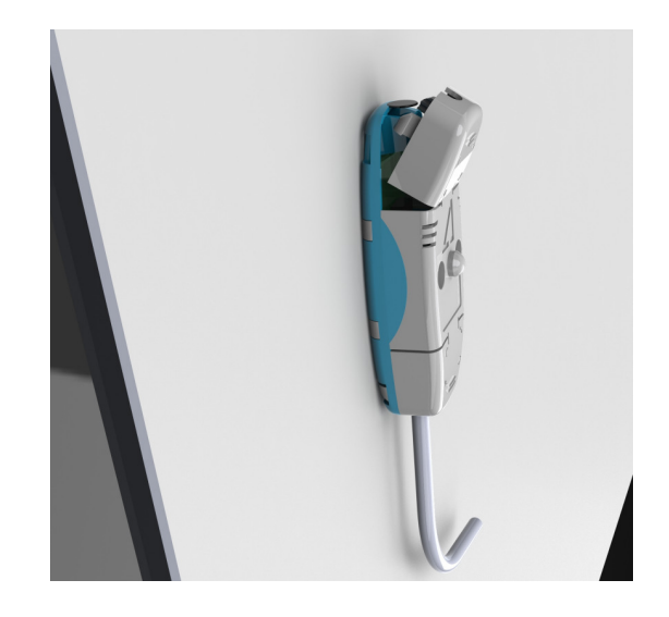
Figure 2: Modern arc light point sensors may be wired in series making the overall installation and wiring faster and more convenient. The most advanced sensors are able to monitor continuously even the photodiode element by integrated light pulse source. The light pulse also feedbacks users on the ready state of the sensor.

Sensor installation practices have been made simpler, a factor especially crucial in retrofitting arc sensors into existing switchgear. The most modern sensor types can be now connected in series instead of traditional radial star structure reducing the needed wiring significantly.